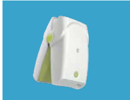
Nail fungus laser therapy device for onychomycosis