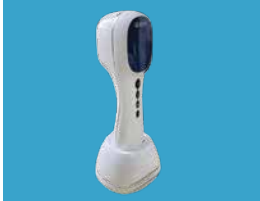
Handy laser therapy device for personal pain relief