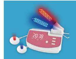
LED light therapy device for male and female private problem