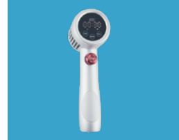
Class IV laser therapy device for pain relief in clinic